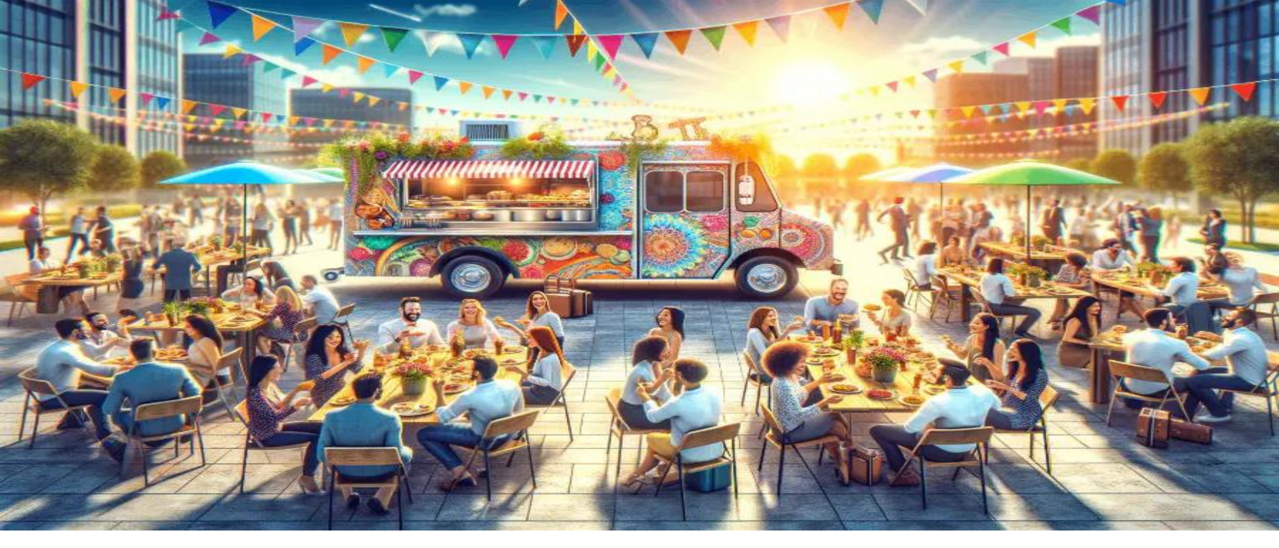
Ordinance No. 07-2024

Street Vendors LDC Update Sections 22-186 to 22-191