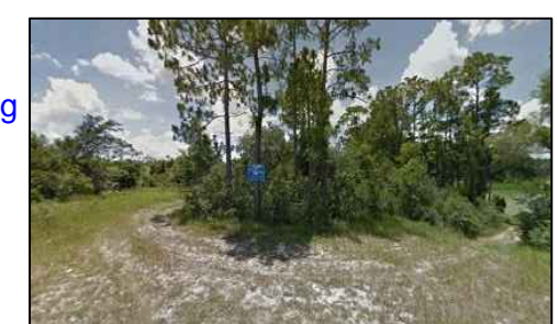
2202 Conway Dr Deltona, FL 32738