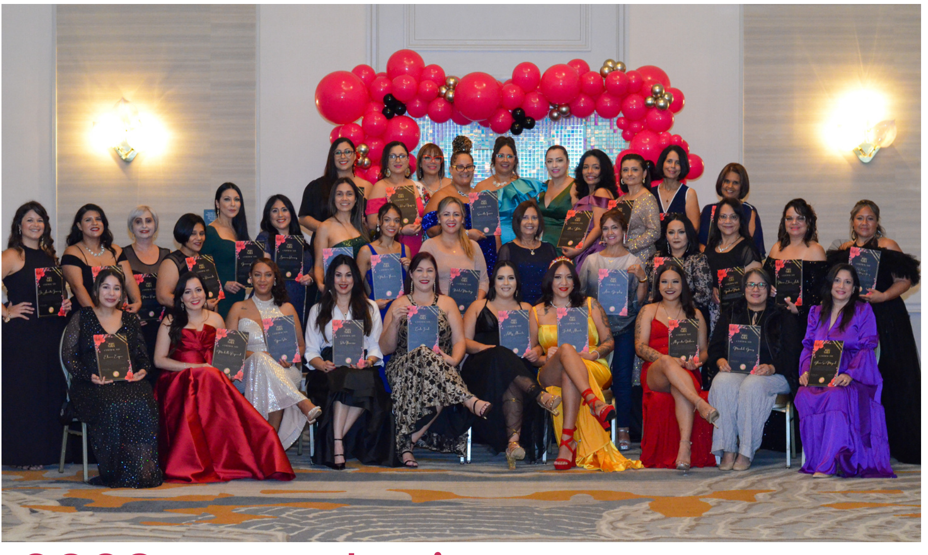
2023 Award Winners_